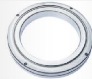
交叉滚子轴承 AR-250 / AR-320 / AR-500